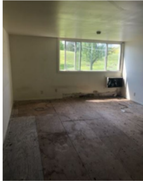
Interior Demolition in Living Room of a Vacant Unit

Rehabilitation Project Update In late March 2023, WinnCompanies successfully secured financing for the overall rehabilitation of the Pines of Perinton. On April 1, 2023 construction crews commenced interior demolition in vacant units, tree trimming, new exterior lighting installations, and roof replacement work. All construction work will follow applicable federal and NY state health and safety regulations. If residents have specific questions or concerns, please contact the rental office.