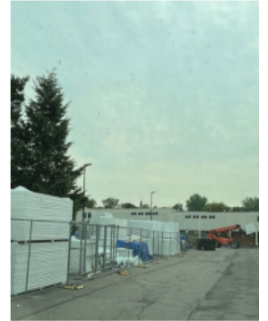
Roofing material is on-site, secured, and work has started

Rebuild Project Update Work to rebuild 19 apartments destroyed during a January 2022 fire is underway and expected to be completed late summer 2023.