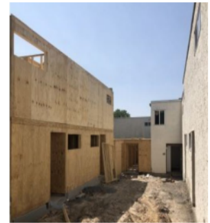
Framing of exterior walls and first and second floors is underway

Questions can be directed to PinesofPerinton@winco.com