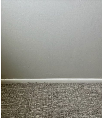
Newly Renovated Flooring & Walls