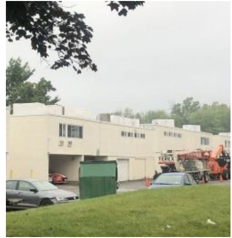
Roofing work is progressing.

Rebuild Project Fire rebuild work progresses with roof trusses and sheathing being installed and tie-in to adjacent buildings almost complete. Roofing and MEP system installation continues to progress.